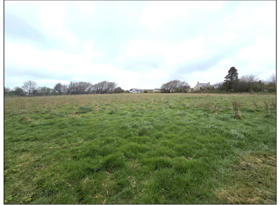
Top left clockwise: Entrance gate from road, across field looking North, NW Elevation of Sheds, Sheds looking from North