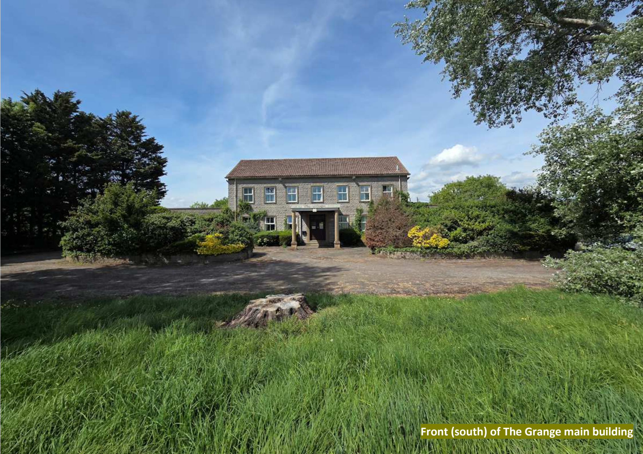
Front (south) of The Grange main building